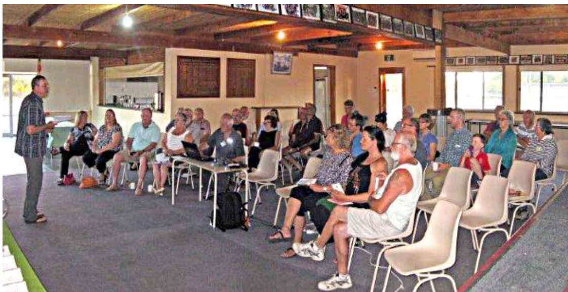
Public meeting at Manoora to inform the local community about the LFT.

The Northern Argus newspaper has printed an article on the evening. Follow the link to read the article at http://www.northernargus.com.au/story/3789963/lavender-trail-extension-planned/