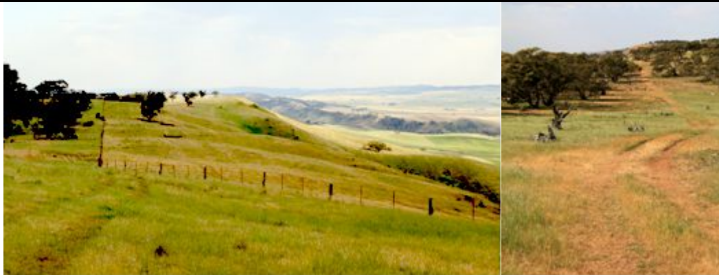
Views from the Lavender Federation Trail near Peppermint Springs