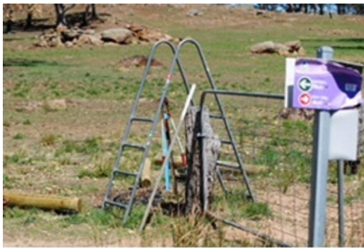
Warped signs, undamaged stile but the fence has been destroyed.