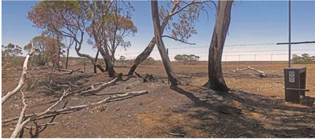
Coppermine Road near Truro. Burnt trees & grass but undamaged stile. A few metres nearby, the fire went either side of a stile. nearby the fires burnt on either side of a stile.