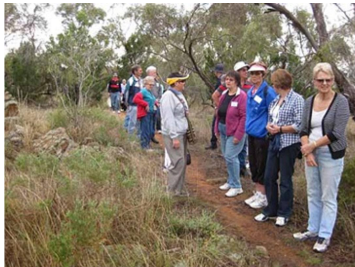
Murray Bridge U3A walking group experience the Ngarrindgeri Hills walking trails.

SARTI has been asked to be a part of the stakeholder group and has accepted.