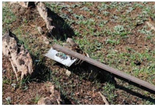
Trail marker on the Munchenberg property near Truro Gorge.