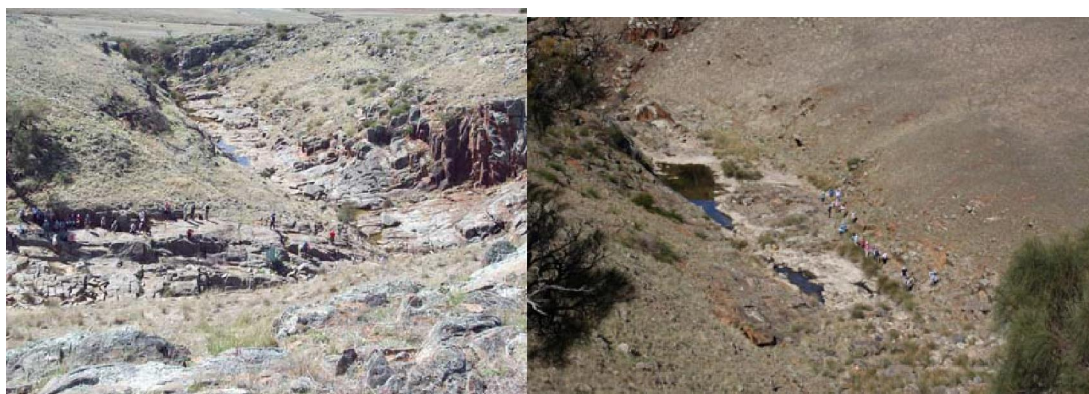
GROUPS OF WALKERS CAN JUST BE SEEN AT THE BASE OF THE GORGE ON THE MUNCHENBERG PROPERTY AT THE OPENING OF THE 2012 WALKING SEASON