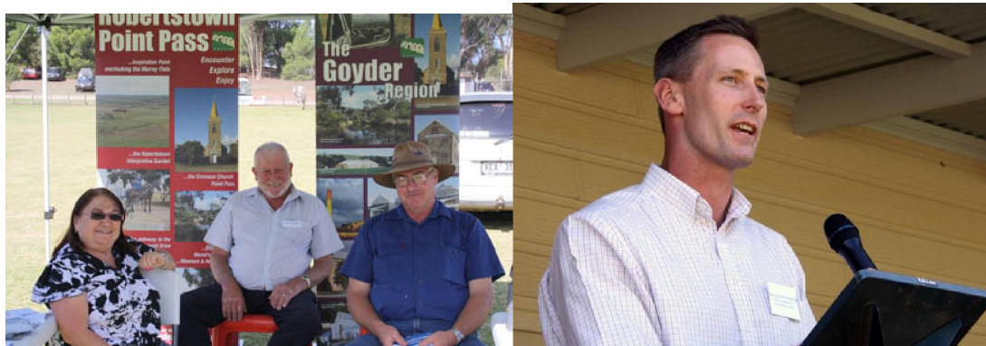
EUDUNDA COMMUNITY, BUSINESS & TOURISM COMMITTEE STAND AT TRURO